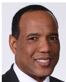
Kevin Keatts Head Coach Eighth Season