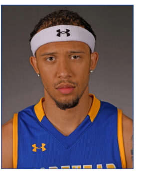
#1 Tucson Redding