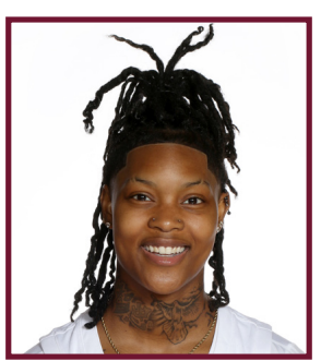
G, 6-0, GR. Chattanooga, Tenn.