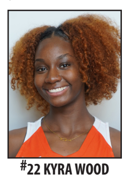
So. • Buffalo, N.Y.