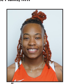
#15 ASIA STRONG