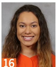
16 ALIA LOGOLEO *So. - OF/INF