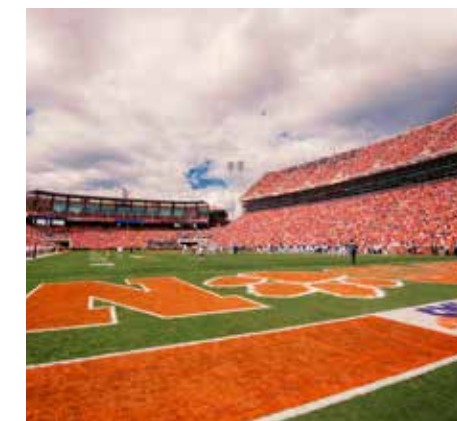
Memorial Stadium Memorial Stadium, also known as Death Valley, is home to the three-time National Football Champions and located right on campus.