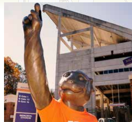
Tiger Mascot Statue Show your Solid Orange pride by posing next to the Tiger statue located outside Gate 1 of Memorial Stadium.