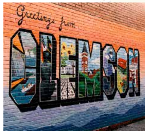
Clemson Mural (Downtown) Located on the wall outside of Tiger Sports Shop (364 College Ave.), this mural design is inspired by the look of a vintage postcard and captures the close-knit town-gown relationship.

Get your picture next to these Clemson landmarks.