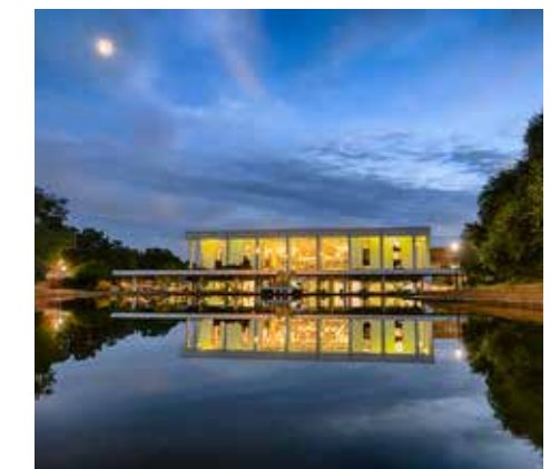
Reflection Pond Located just outside of Cooper Library, the reflection pond provides a scenic backdrop during any season.