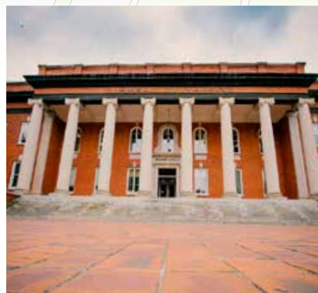
Steps of Sikes The steps of Sikes Hall are a popular spot among students for senior portraits, graduation pictures and other group photos.