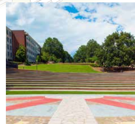
Carillon Garden With the Outdoor Amphitheater, reflection pond and Cooper Library all in view, you'll be hard-pressed to find a more picturesque spot on campus.