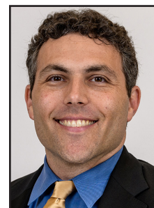
Josh Pastner Head Coach