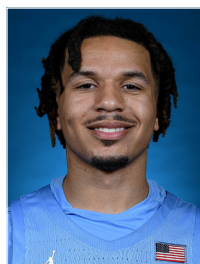
2 – COLE ANTHONY 6-3, Fr., G New York, N.Y.