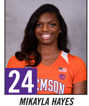
C • 6-3 • R-So.