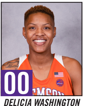
G ● 5-10 ● Sr.