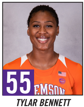
C ● 6-4 ● Jr.