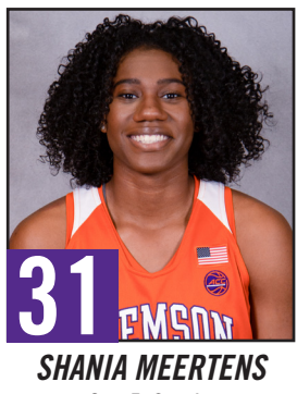
G • 5-8 • Jr.