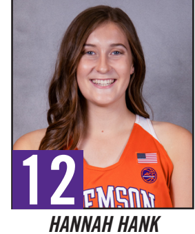
C ● 6-2 ● Fr.