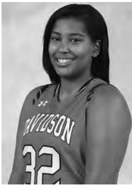
Guard • So. • 5-11 Schenectady, N.Y.