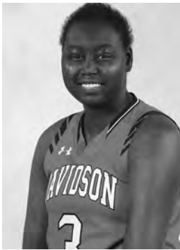
Forward • Jr. • 6-1 Randallstown, Md.