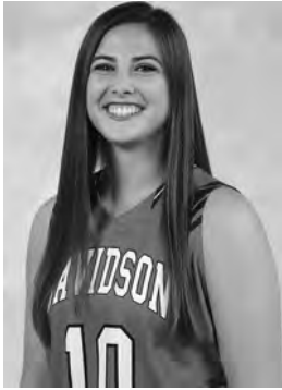
Guard • Fr. • 5-9 Dallas, Texas