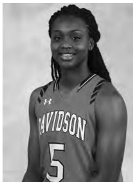
Guard • Sr. • 5-9 Durham, N.C.