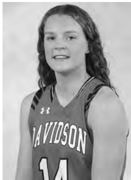
Guard • Fr. • 5-9 Melbourne, Australia