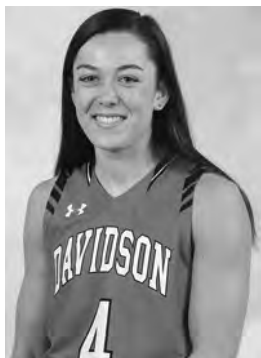
Guard • So. • 5-6 Apex, N.C.