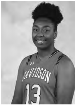
Forward • Sr. • 6-2 Farmington Hills, Mich.